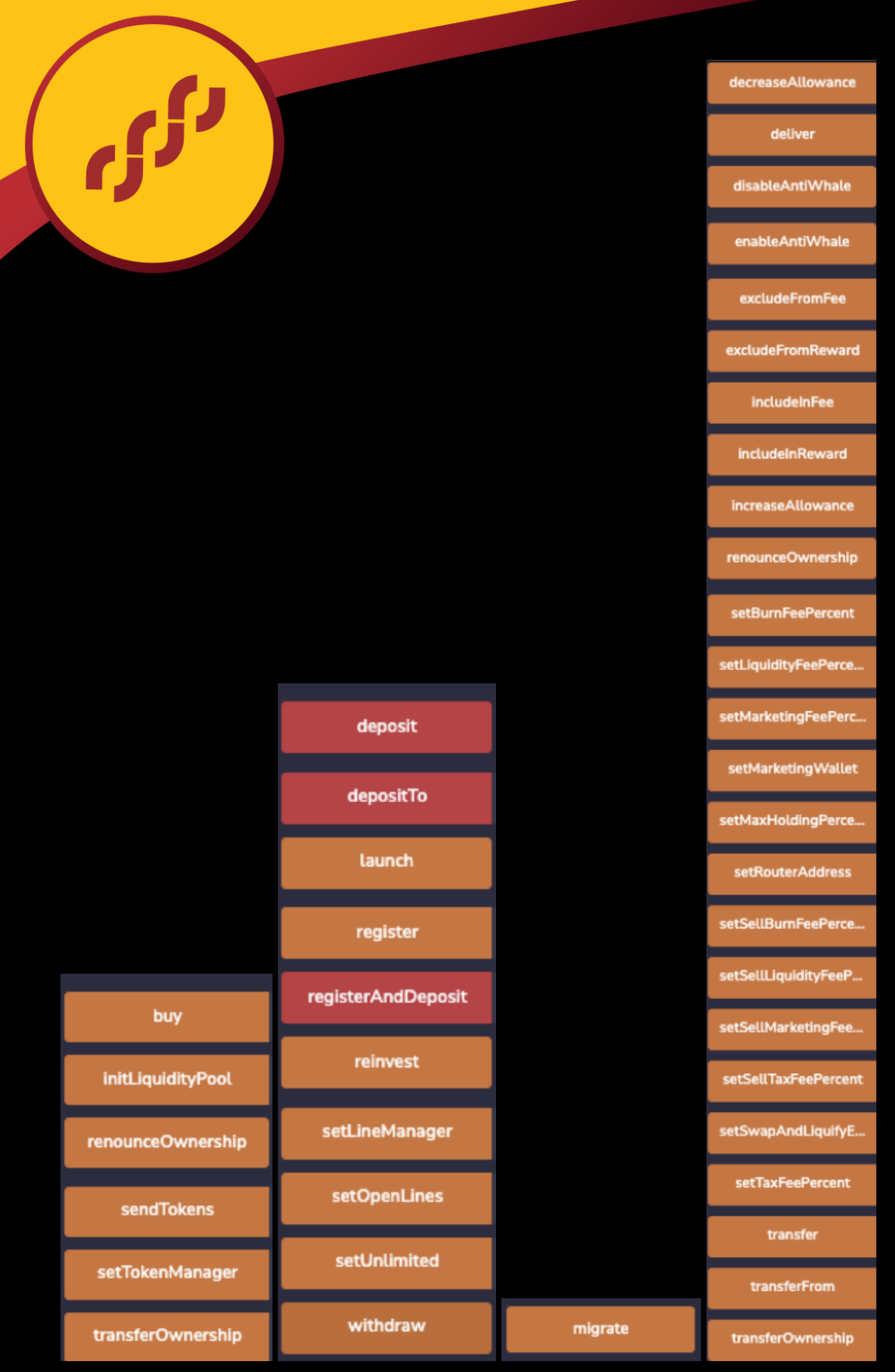
1.2 Write functions of contract